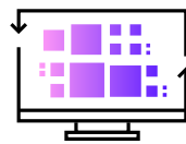
Monitoring and Alerting